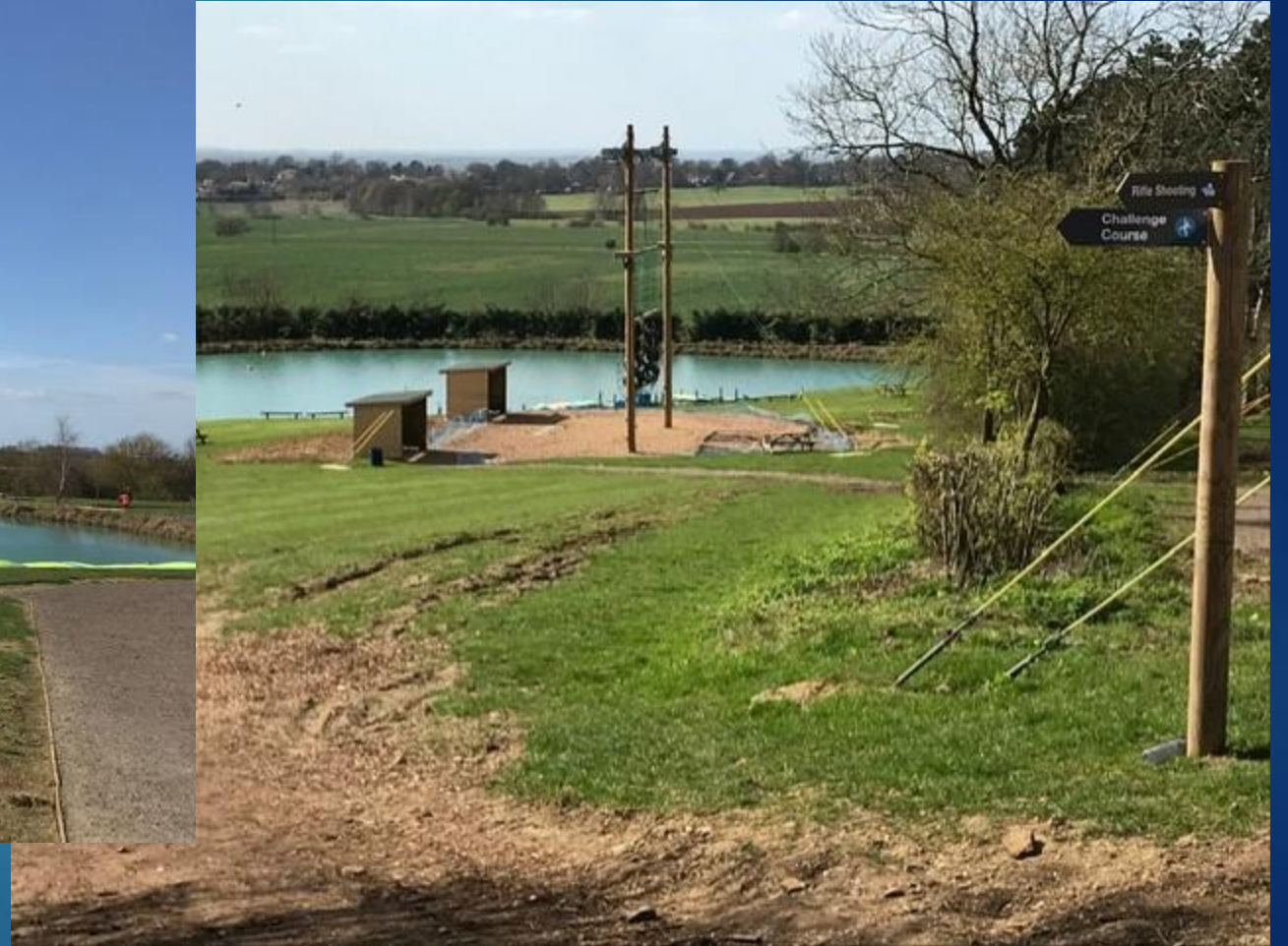
Raft lake and Kayak lake