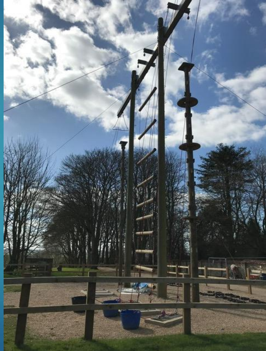
All aboard, Jacob's ladder