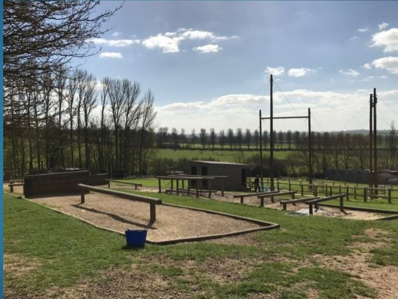
Team building assault course