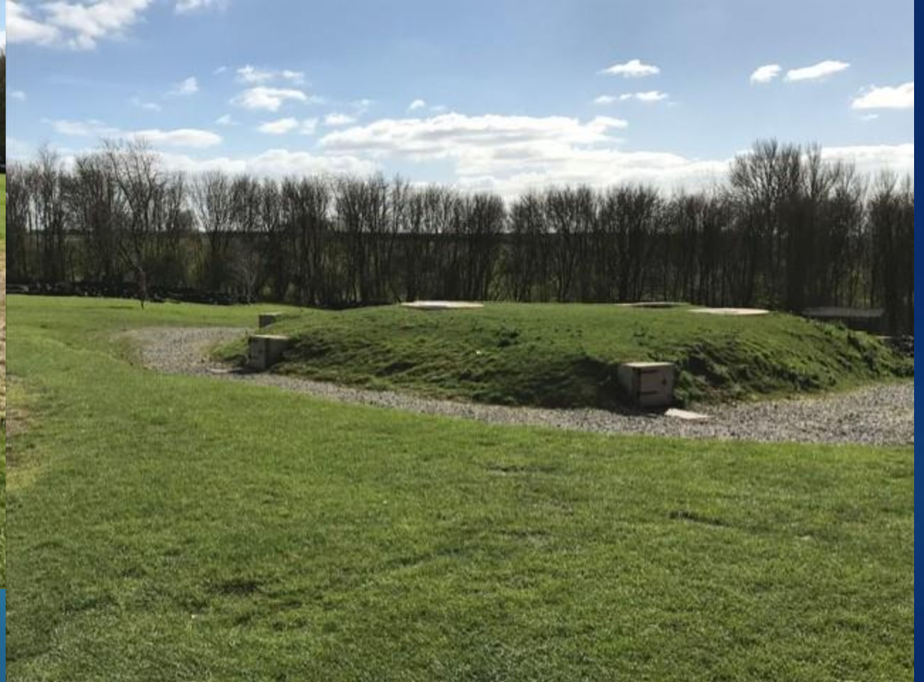
Tunnels and caving