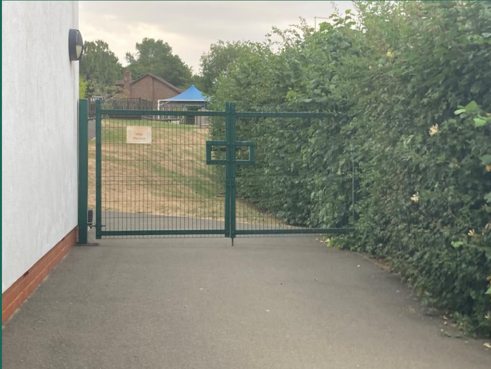
All of Y5 and Y6 enter school via this gate