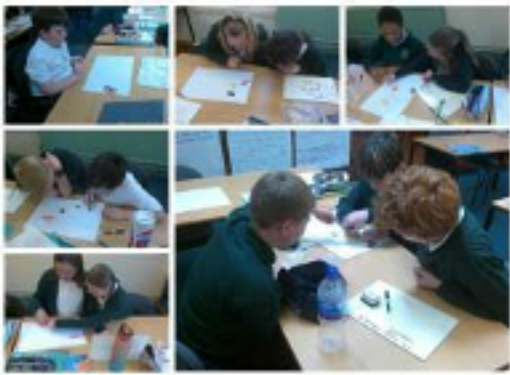
A fantastic science lesson in Year 6 saw the children develop their understanding of classification key by attempting to classify a series of sweets!

Our PTA-led sponsored bounce and sponsored Zumba events were hugely successful in raising funds for the school! Thank you as ever to our amazing PTA.