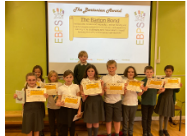
Congratulation to this half-term's Bartonian winners in KS2 for showing our school value of Respect!