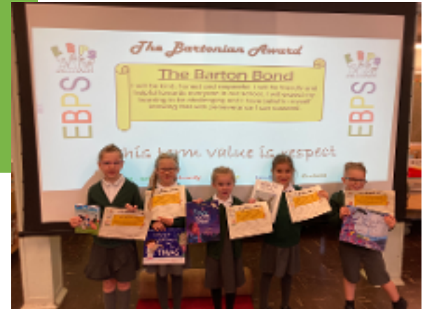
Congratulation to this half-term's Bartonian winners in KS1 for showing our school value of Respect