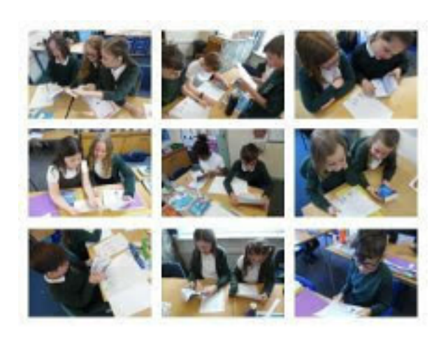
Year 5 have been receiving letters in French from their pen pals in Niort! They have learned all about their pen pals' pets, favourite foods and sports.

Year 4 were excited to start their new science unit about electricity. Their pre-assessment allowed them to show off what they already knew including creating a circuit to power a light bulb.