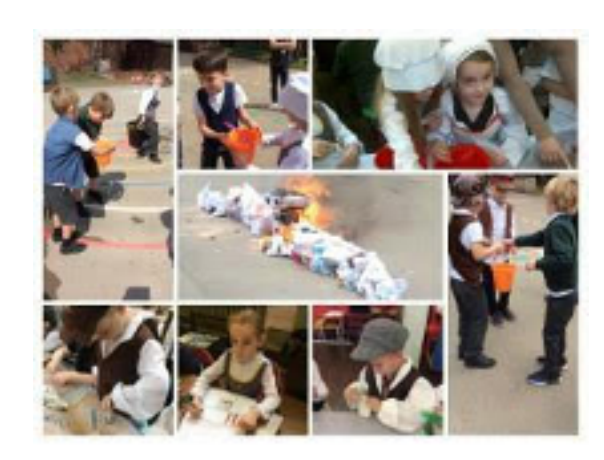
Year 2 absolutely loved their Great Fire of London Day! They got to write with quills, sew and create candle holders. They ended the day by creating their own model houses which were later burnt to see how the fire had spread.