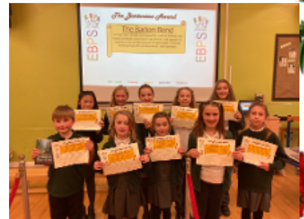
Congratulations to our Bartonian winners for 'Excellence' in Key Stage 2!