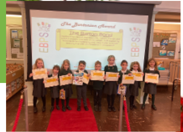
Congratulations to our Bartonian winners for 'Excellence' in Key Stage 1!